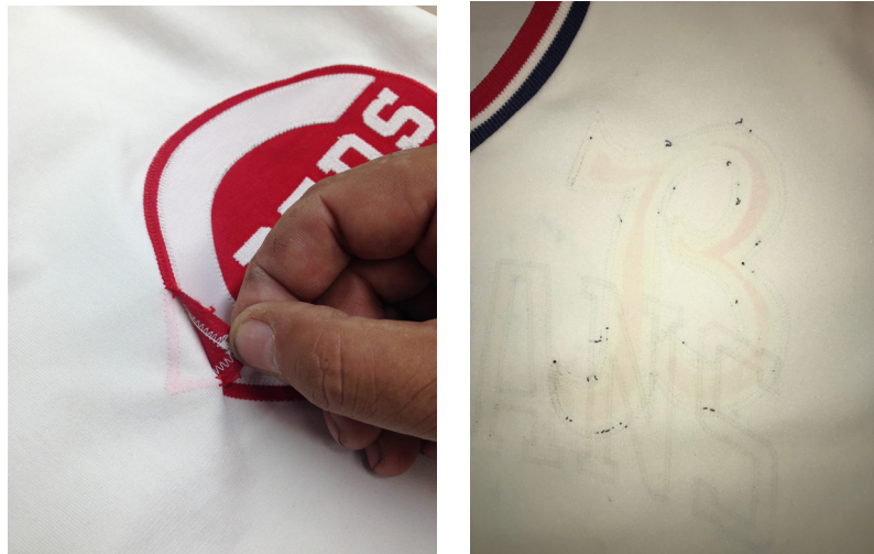
Lifting the corner of this Reds logo, I can already tell from ample experience that it is going to leave a red stain that will be very, very difficult to remove. At right is the result if having removed a minor league logo that had been sewn on this former Indians MLB jersey. A lot of scrubbing and use of a bleach pen faded it enough to make it less objectionable.

Staining: While glue residue usually can be successfully removed, the most common problem with lettering that has been removed is color transfer to the jersey fabric. In short, the jersey may be permanently stained by the lettering that