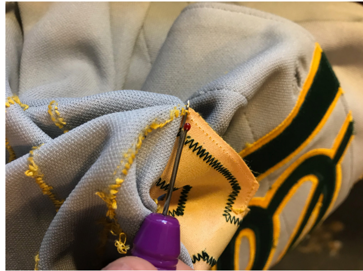
Showing the correct way; carefully ensuring that there is no jersey fabric pinched between the tool and the twill.

If the lettering won't come off, or comes off with difficulty, tearing or leaving behind massive glue and stains, it is best to stop and send me a photo. We can decide what to do. Rarely, but sometimes old lettering is so tightly adhered that its removal is ill advised unless we will be sewing the exact same thing over top. I will often advise you to rip the thread but let me try to get the lettering off.