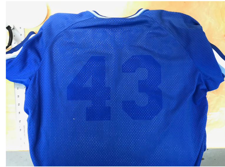
The player numbers leave distinct unfaded marks on this game worn mesg BP jersey. There is not much you can do about this except cover the spots with new numbers which will make this much less obvious.

The newest "tech" fabrics like Cool Base and Flex Base™ greatly dislike rough handling. If they are badly stained there may be no remedy except recovering the spots with the same lettering again. When this stuff starts to tear, it reminds me of wet toilet paper: it loses its structural integrity in a hurry.